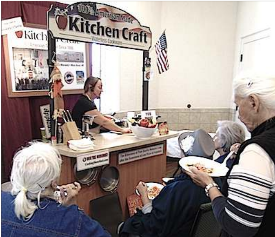
Christmas in the Villages was held at the Wildwood Community center last month. Some 75 vendors attended, showing off

their businesses, talking to people, giving free samples. Kitchen Aid had a booth that looked great. A lot of work and detail went