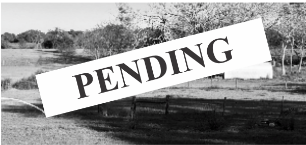
4821 SUNNYSIDE DR FRUITLAND PARK

Very nice 2 bedroom, 2 bath Colony Patio Villa in the desirable Village of Chatham. Villas of Sherwood. Built in 2002, new carpet, new paint. Central heat/air. 1167 sq.ft. Heated. Laundry. 1.5 garage. $168,500