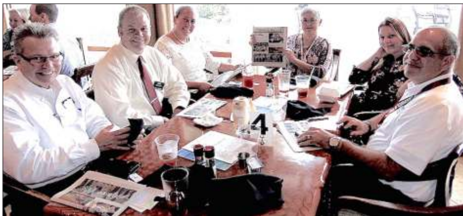
Nothing But Networking was the last networking event of the year. It was well attended and was held at the Waterfront Inn in The Villages. I met some new

their businesses, talking to people, giving free samples. Kitchen Aid had a booth that looked great. A lot of work and detail went