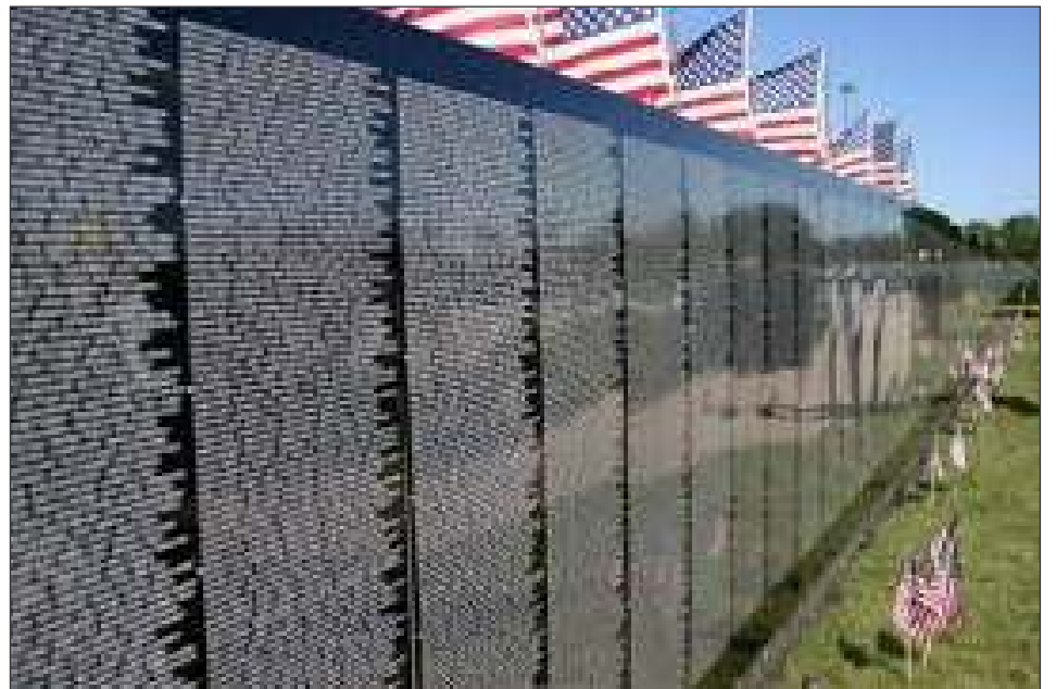
The traveling Wall came to Lady Lake / The Villages. Opened Nov 2 and closed Nov 4th. The Vietnam Traveling Memorial

At the end of the day, my son, his wife and their son came home and there we were the night before Thanksgiving at the Lory Farm and shared memories around the table by having a last minute planned meal for about a dozen family members. That's what I'm thankful for!