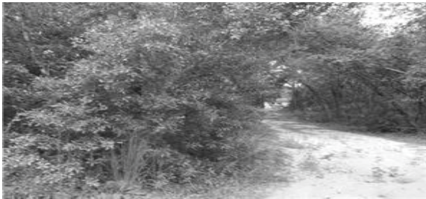
OAKRIDGE DR LADY LAKE

3 bedroom, 2 bath Manufactured Home on ten acres. Built in 2005, 1620 sq.ft. Living area. 1304 sq.ft of open porch. Central heat/air. Fenced and cross fenced. Well and septic. Paved street. Only ten minutes from The Villages, just off Eagles Nest Rd. PENDING $310,000