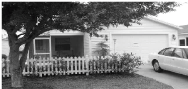
17383 SE 77TH SYCAMORE AVE. THE VILLAGES

Very nice 2 bedroom, 2 bath Colony Patio Villa in the desirable Village of Chatham. Villas of Sherwood. Built in 2002, new carpet, new paint. Central heat/air. 1167 sq.ft. Heated. Laundry. 1.5 garage. $168,500