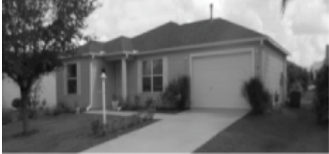
1500 Murrells Inlet Loop

Village of Duval. Furnished 2 bedroom, 2 bath Ranch . Wall to all carpet. Laundry in garage. Central heat/air. 1.5 garage. No smoking.