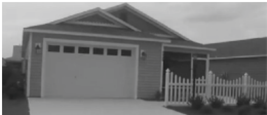
2949 Currie Ct.

NEW VILLA IN FENNEY. Furnished 2 bedroom, 2 bath. Inside laundry, central heat/air. 1.5 garage. No smoking. No pets. $1,350 month.