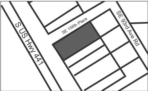
15600 HWY 441 SUMMERFIELD

Treed lot located in Carlton Village Subdivision. NO HOA or DEED RESTRICTIONS. Manufactured and Site Built homes allowed. Situated close to the resident park and Clearview Lake. Convenient to shopping, restaurants, medical facilities and The Villages. $9,750