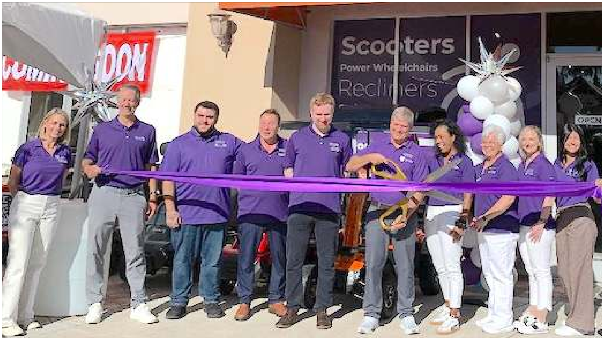
Welcome to the community and welcome to the North Lake area Chamber of Commerce. Spinlife Mobility Solutions has all of your mobility needs, lift chairs, wheelchairs, walkers, and more located at 570 N. US Highway 27/441 in Lady Lake, Florida