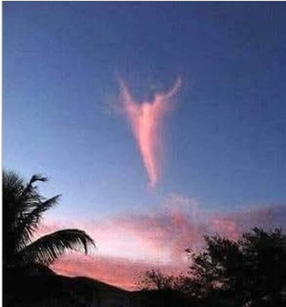
Where did this picture come from? I don't know where it came from but it is a sign! It a beautiful picture to display this time and date.

so gallantly streaming? And the rocket's red glare, the bombs bursting in air, Gave proof through the night that our flag was still there; O say does that star-spangled banner yet wave O'er the land of the free and the home of the brave?