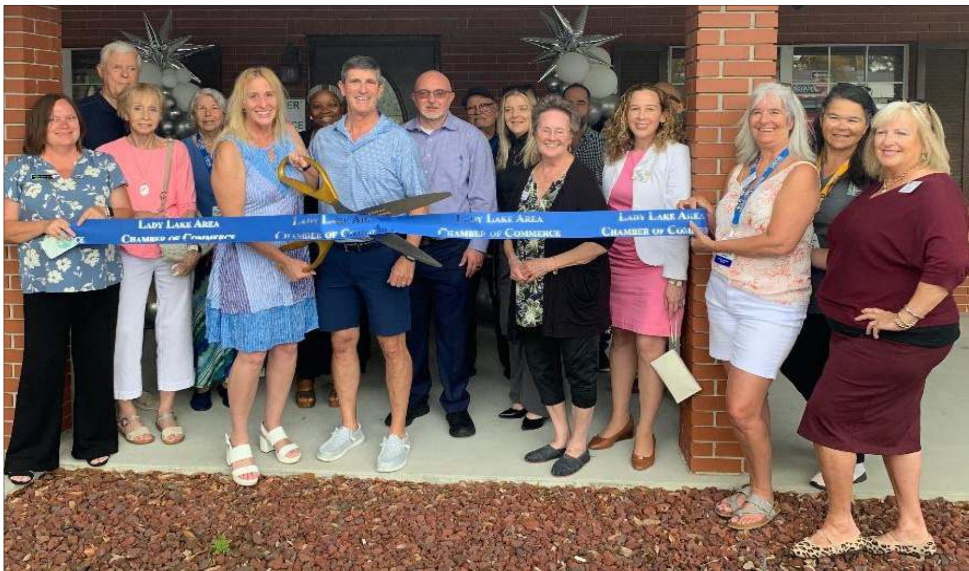
Welcome, Silver Castle Studio! If you are looking for a photographer that also takes pet photos. Please give them a call at 815-768-9903.