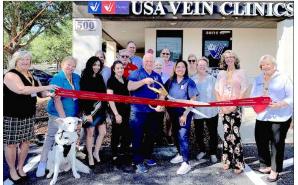
Grand Opening Ribbon Cutting by Lady Lake Chamber for USA Vein Clinics. Located in the Oakland Hills Professional Center in Lady Lake.