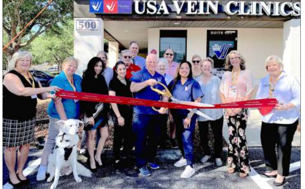
Grand Opening Ribbon Cutting by Lady Lake Chamber for USA Vein Clinics. Located in the Oakland Hills Professional Center in Lady Lake.