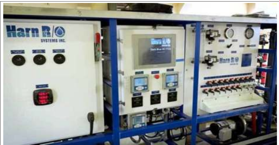
District Helps Plant City Celebrate Opening of Demonstration Facility

Plant City recently celebrated the opening of its One Water Demonstration Facility. The site will test water purification technology for a potential full-scale project to create a drinking water supply. District leaders were on hand to applaud Plant City's innovative step in exploring the opportunities recycled water could provide in ensuring the area's future drinking water supply. See www.swfwmd.state.fl.us for more.