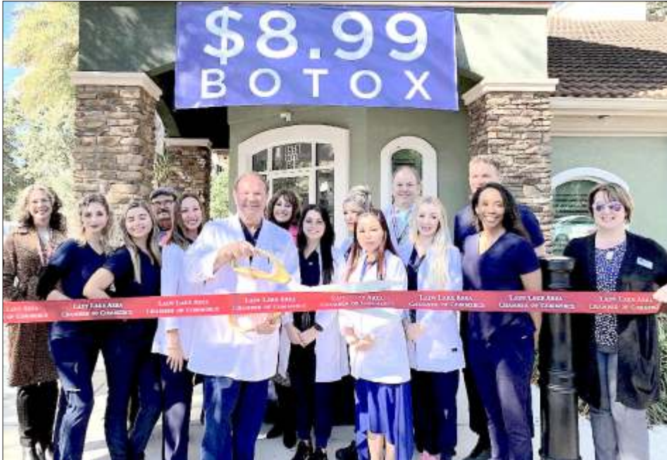
Goldfingers Aesthetics & Plastic Surgery Grand Opening and Ribbon Cutting 8550 NE 138th Ln Bldg 600, Lady Lake, FL 32159 352-775-4901