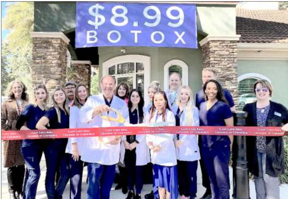
Goldfingers Aesthetics & Plastic Surgery Grand Opening and Ribbon Cutting 8550 NE 138th Ln Bldg 600, Lady Lake, FL 32159 352-775-4901