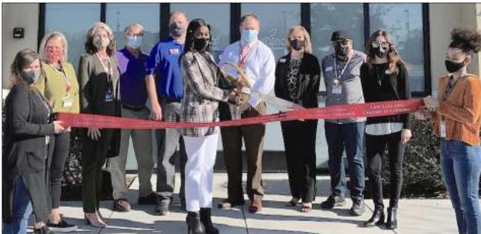
Ribbon Cutting for Curaleaf 919 N. Hwy 441 Lady Lake, FL 32159