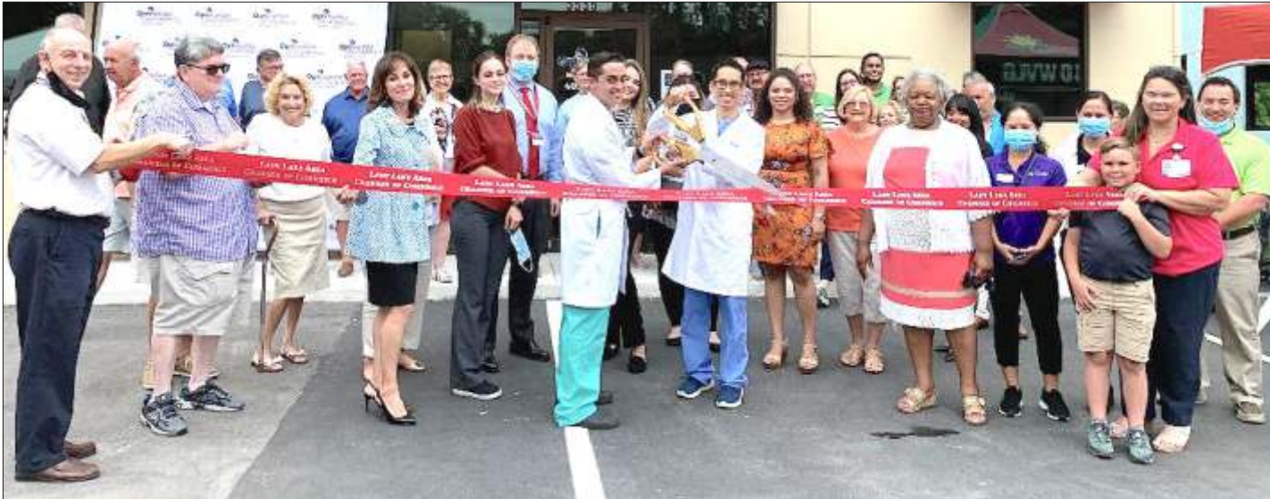
Grand Opening and Ribbon Cutting for Optimotion Orthopedics 5555 E SR 44 Wildwood, FL 34785