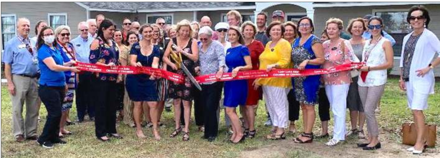
May 20th Ribbon Cutting and Grand Opening at Affiliated Title, 5805 E CR 462 Wildwood, FL 34785.