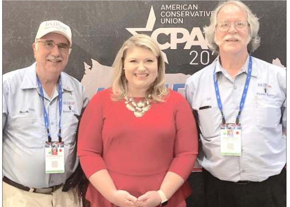
Congresswoman Kat Cammack (FL-3) was interviewed at CPAC by The FAIRtax

a. The culture in The Villages is something we have not ever experienced