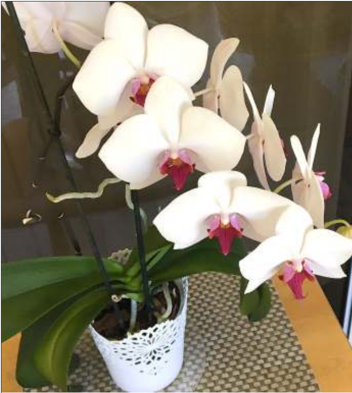
Last month I ran some pictures of flowers and ask that some of readers to share. Angelina Ahrem sharing a picture of her Flowers.