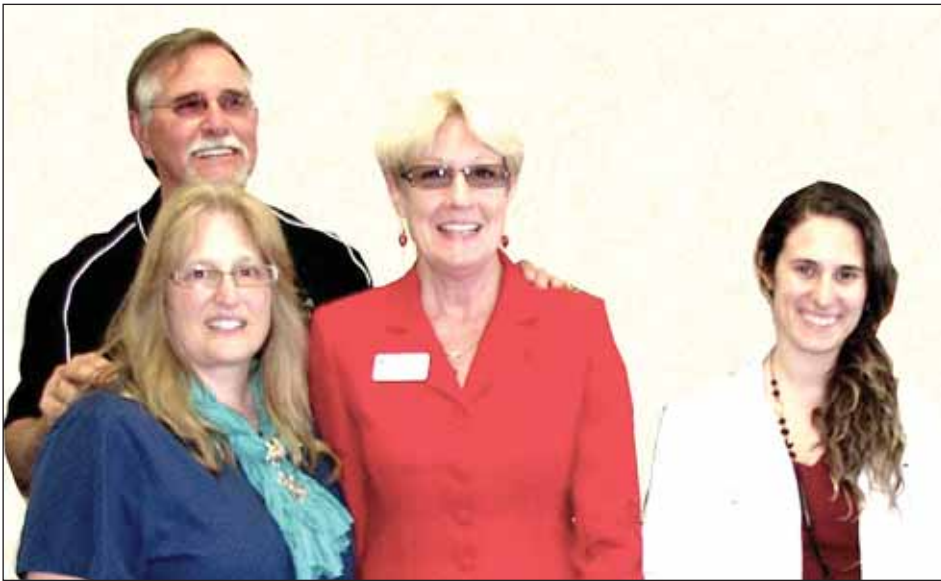
Meet the Audibel Hearing staff at their new location in Spanish Plains Shopping Center. They posed for this picture the day of the Ribbon Cutting. They have state of the art equipment and exceptionally talented hearing specialists and office help. Drop by and meet them, they are between Subway and the UPS store on the north end of the Plaza.